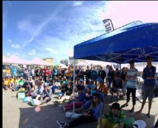
Grass roots event After School Contest Surf, Skate, Music Festival Lacanau France