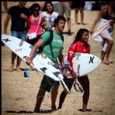
Mahina Maeda, World Junior Champ Hossegor France