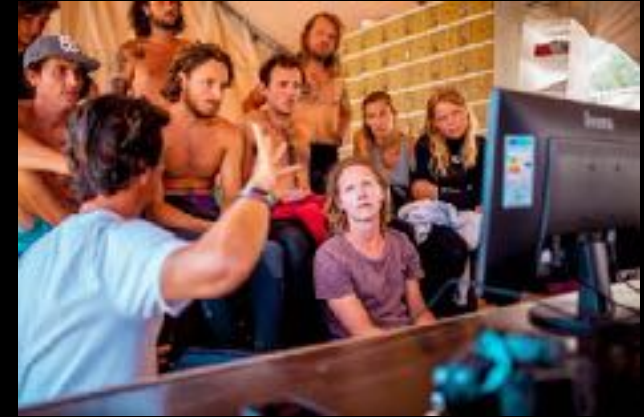
Customers experience, Biscarosse, France