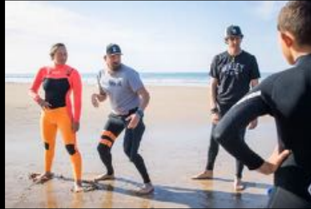
Carissa Moore, « learn from the best » Agadir, Morocco