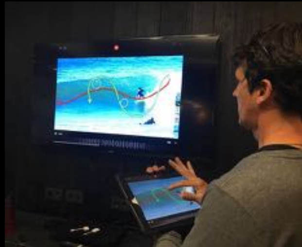
Using best technology San Sebastian, Spain