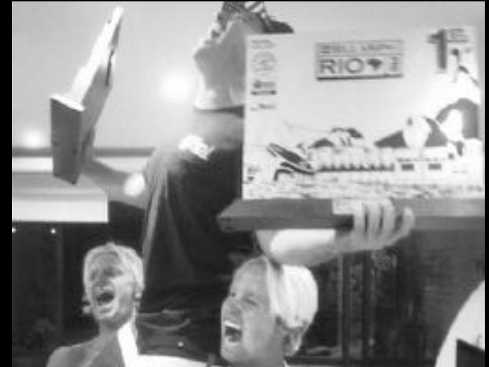
Social Media Spreading the fun on instagram Oi RIO PRO Rio De Janeiro, Brazil