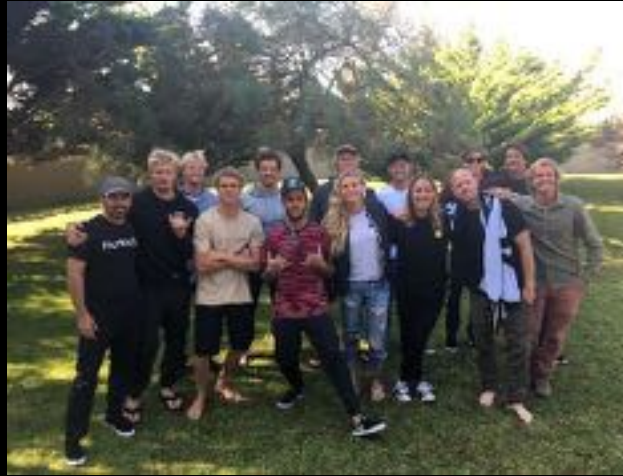
Sport Marketing: Managing the best Athletes in the world