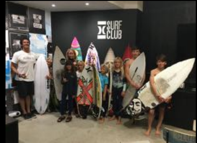
Kids experience San Sebastian, Spain